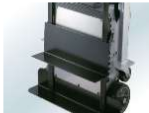
Height Adjustable TP (HAT-1)