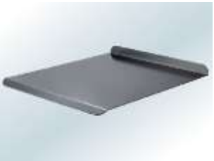
Lift Plate Attachment (LPA-1)