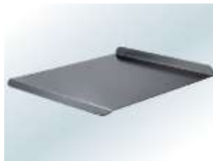
Lift Plate Copier (LPA-1+LPA2)