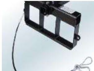
Lift Hitch Attachment (LH-3)