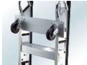
Swivel Caster Attachment (SCA-1)