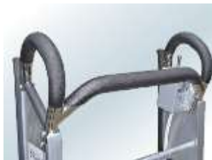
Magnum Handle (1306)