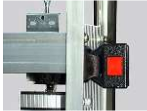
Auto-rewind Safety Strap (RW-1)