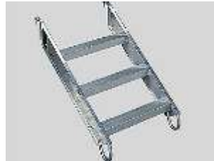
Portable Steps 104cm (PS-41)