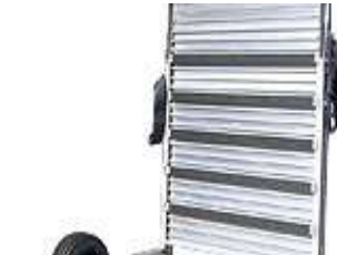
Copy Caddy (RPA-1 1355)