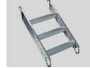
Portable Steps 74cm (PS-29)