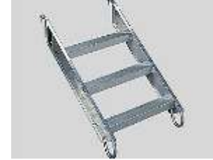
Portable Steps 112cm (PS-44)