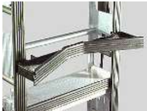
Barrel Attachment (BAR-1/BAR-2)