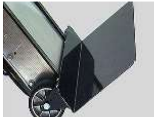
Big Toe Plate 12-38 inch (BTA)