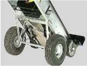
Big Wheel Attachment (BWA-1)