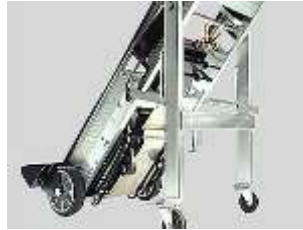
Retractable Load Support (RLS-1)