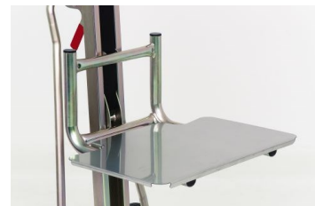
Folding Platform Standard Accessory 100.529