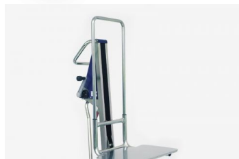
Cargo Support Accessory 100.530