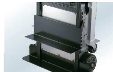
Height Adjustable Toeplate Accessory HAT-1