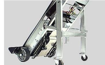
Retractable Load Support Accessory RLS-1