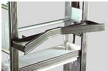
Barrel Attachment Accessory BAR-1 / BAR-2