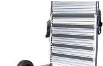
CopyCaddy Accessory RPA-1 / RPA-2