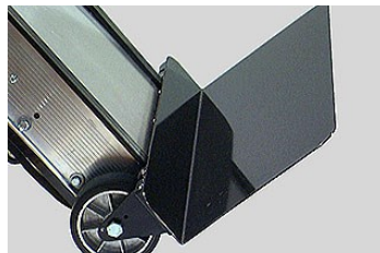
Big Toeplate Attachment Accessory BTA-30-71 / BTA-30-81cm