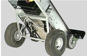
Big Wheel Attachment Accessory BWA-1