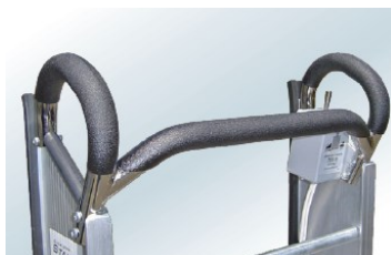
Magnum Handle Upgrade Standard Accessory