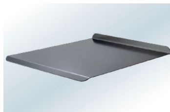
Lift Plate Attachment Accessory LPA-1