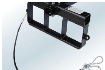
Lift Hitch Attachment Accessory LH-3