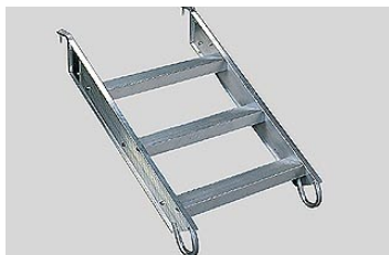
Portable Steps Accessory 53 / 74 / 86 / 104 / 112cm