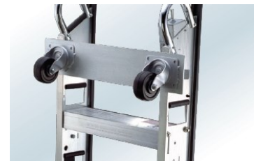
Swivel Caster Attachment Accessory SCA-1