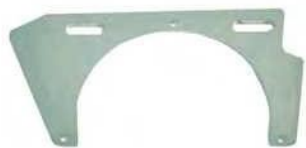
10 KG BALLASTS