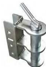
DROP PIN Ø38 MM