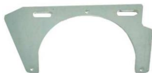
7 KG BALLASTS