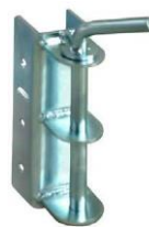
DROP PIN Ø16 MM