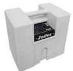
BATTERY PACK 40AH LITHIUM