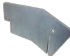
4 KG BALLASTS