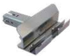
ROLL BOX HITCH