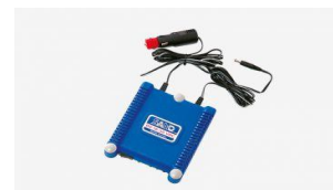
In-transit charger BC 10-30 Accessory 100 502