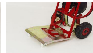
Toe plate with 2 swivel castors 4SA-F 400mm Accessory 100 516