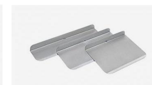
Slot-on plates - 300mm Accessory 100 559 (590mm)