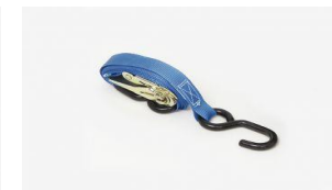
Strap 3.5m (2 hooks and ratchet) Standard Accessory 100 503