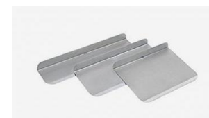
Slot-on plates - 190mm Accessory 100 557 (700mm) Accessory 100 558 (1000mm)