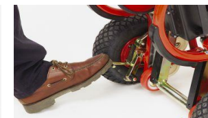
Automatic brake for MTK 190 Accessory 100 533