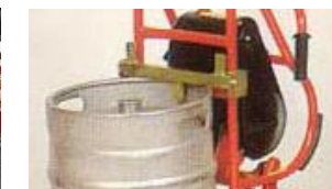
Attachment for barrels Accessory 100 526