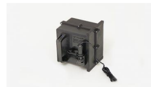
Quick-change battery BU Standard Accessory 100 500