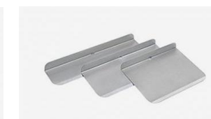
Slot-on plates - 190mm Accessory 100 560 (800mm)