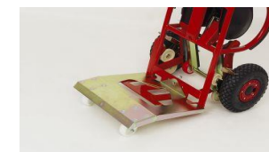
Toe plate with 2 swivel castors SA-LF 500mm Accessory 100 513