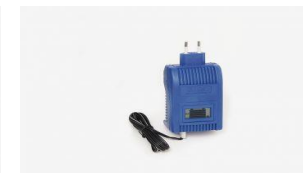
Battery charger BC 100-230 Standard Accessory 100 501